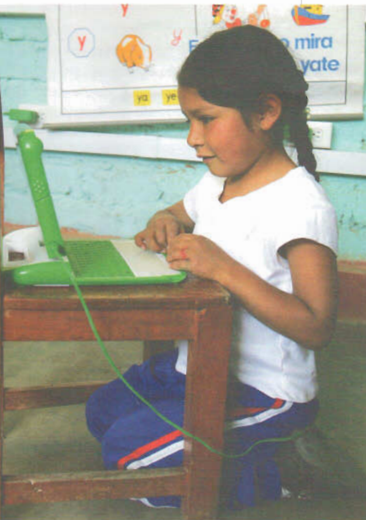
One of the goals of hypothetical NGO Youth Voices for Democracy is to provide young people with computers. This child in Peru benefited from the real NGO One Laptop Per Child project that donated small laptops to schoolchildren in Arahuy, an Andean village.

A project plan needs to define what you want to accomplish for the target population. In other words, what will