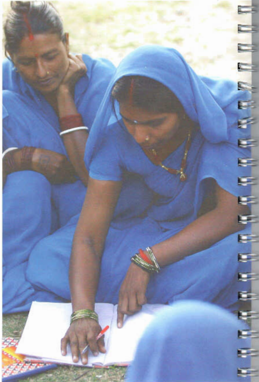
Nepalese women from the Bakduwa Paralegal Committee meet regularly in their remote village of Joganiya, Saptari District. Such committees, active throughout Nepal to fight discrimination and abuses, operate like NGOs. They were set up with the help of UNICEF as part of an anti-trafficking program.