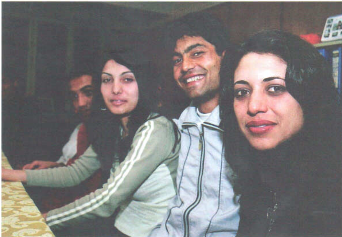
Members of Alternativa, an NGO advancing the rights of the Roma community in Biala Slatina, Bulgaria, participate in a World Bank Development 360 project.

particular skill, consider revising the training curriculum or finding better trainers. Too often, the results are sent to donors but are not used to help NGOs improve their programs.