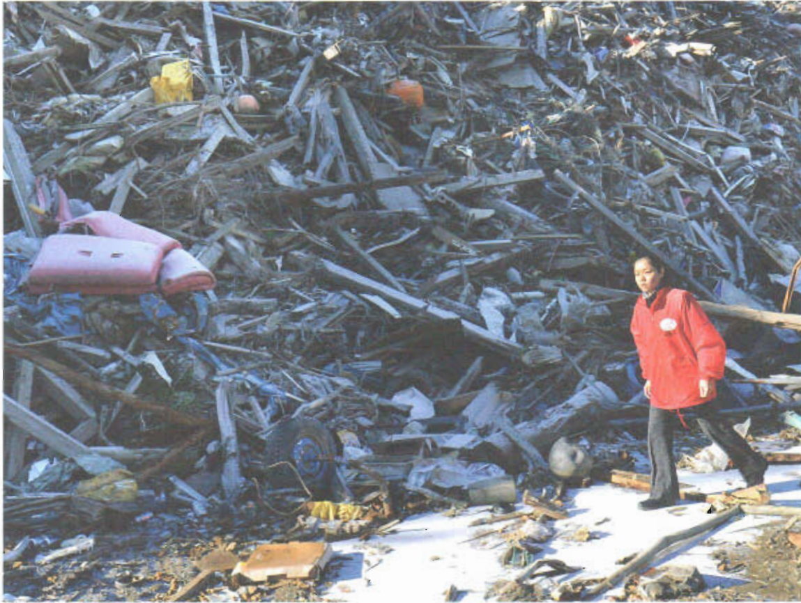
A year after the devastating earthquake and tsunami in Japan, a member of the Japanese NGO Association for Aid and Relief (AAR) walks past ruins of a school in the city of Kamaishi. The AAR partnership with the International Rescue Committee helps distribute assistance to people still struggling with effects of the disaster.

to address the root causes that cross geographic boundaries. When anti-corruption groups from various localities get their heads together, they might realize that what's really needed is a national law. That would open the possibility for them to coordinate their efforts in a nationwide campaign to pressure legislators to pass such a law.