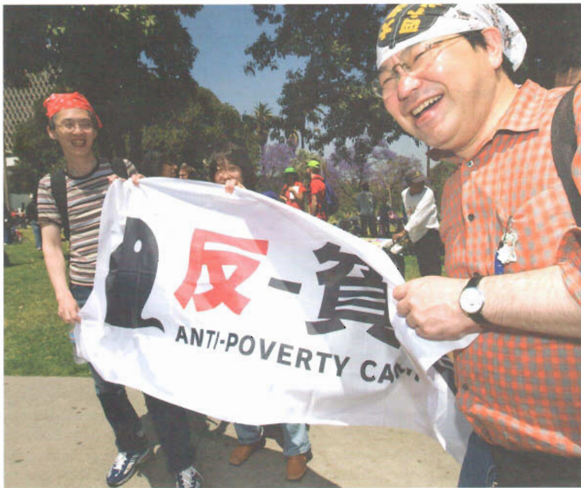
Here members of the Anti-Poverty Campaign, a Tokyo-based NGO, tap their community support across the seas, as this Los Angeles, California, demonstration shows.