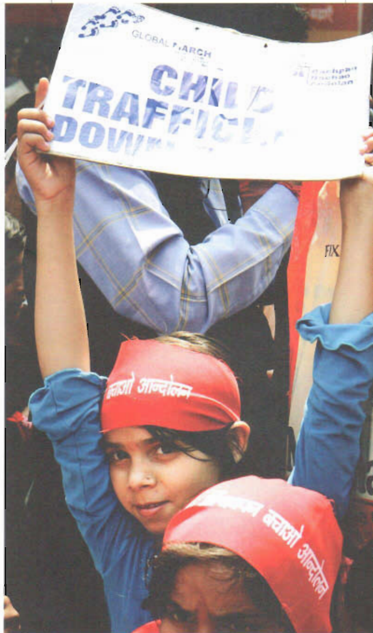
Bachpan Bachao Andolan (BBA), or the "Save Childhood Movement," is an example of a successful NGO. It began in the 1980s with a handful of people committed to ending child labor and trafficking. BBA's marches against child trafficking, like this one in New Delhi, India, spread across India and the world.

5. Treat all community members with fairness, dignity and respect. The board needs to communicate this principle