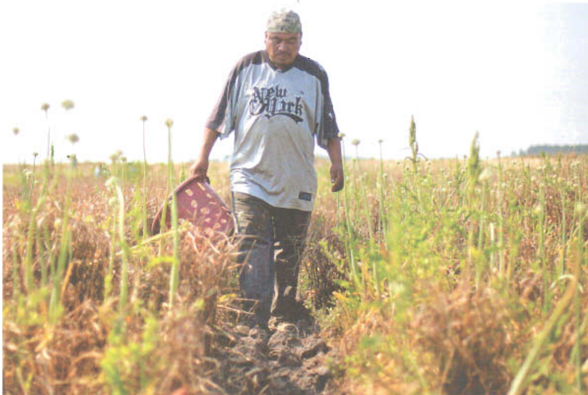
The hypothetical NGO Migrant Workers' Support Network aims to assist people such as this migrant worker in a Vidalia onion farm in Georgia.

workers and a public education campaign about how migrant workers contribute to society. But its leaders wisely realize that doing all these at once would be biting off more than they can chew. Instead, they pick one or two projects and do them well. This way, the NGO can build up a track record of success and learn what it takes to be effective. If you are uncertain about the best place to start, conduct a simple community survey or needs assessment.