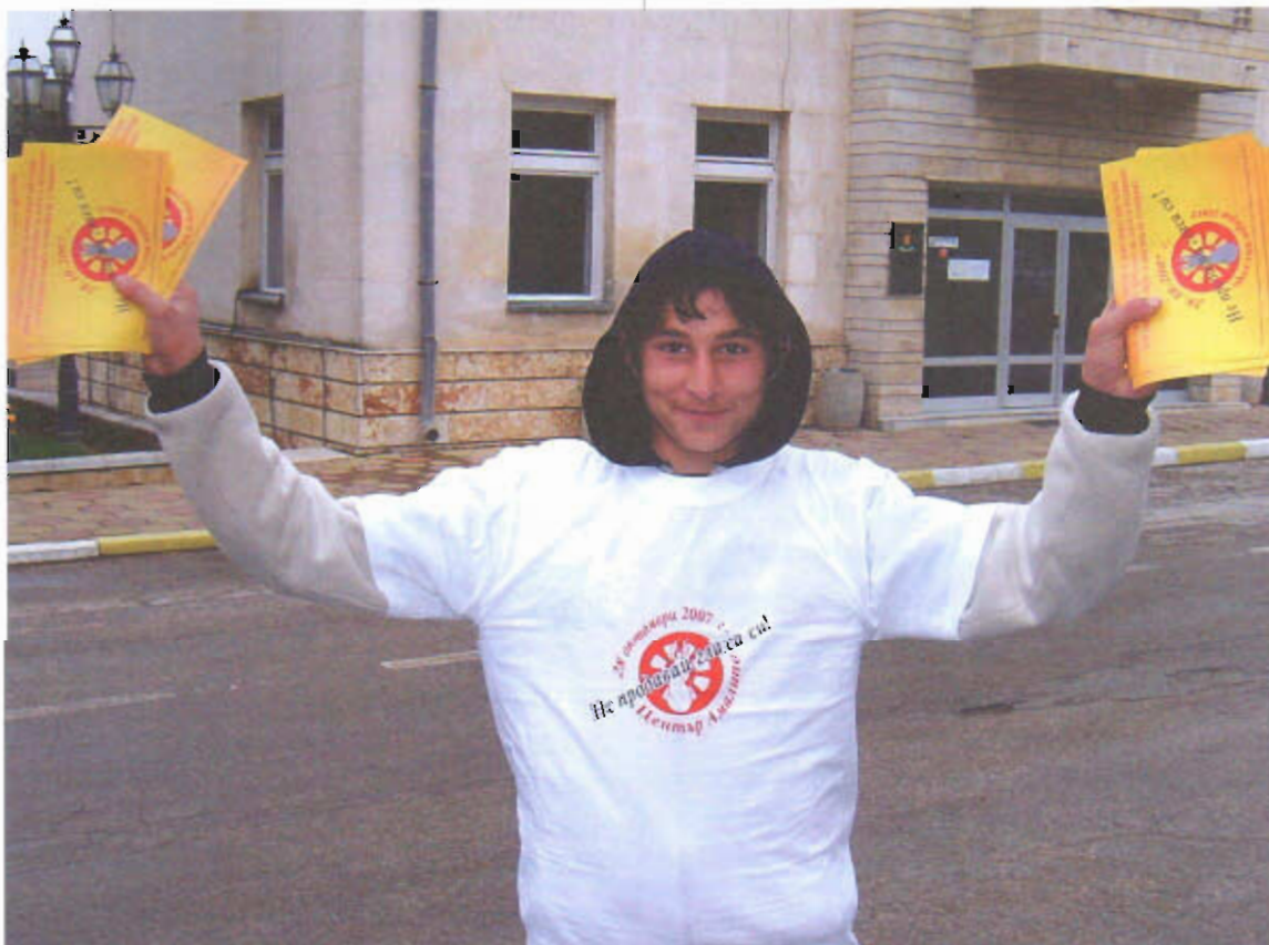
"You Choose!" is the catch phrase during a voter education campaign in Bulgaria. During local elections a young activist in Veliko Turnovo hands out information to encourage voting in the community.

The first step of evaluation is to define the outcomes you want a project to achieve. Do this at the design phase of a project. Going back to Youth Voices' computer learning center and their