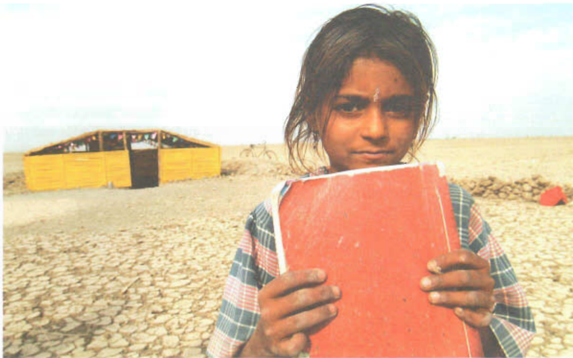
This young girl in India's remote Rann of Kutch, in Gujarat, is the child of a migrant salt worker. Such a child might benefit from an NGO focused on helping migrant laborers and their families, like the NGO suggested in this chapter.

As your NGO matures, its projects and activities will evolve in response to the changing needs of the community as well as your own lessons learned. You might decide to expand some activities and cut back on others or completely restructure your programs.