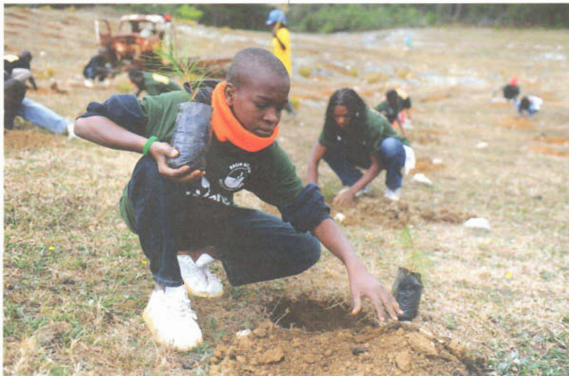
The Haitian NGO Fondation Seguin partnered with USAID to involve schoolchildren in a tree-planting program in Parc National La Visite, Haiti. Children from neighborhoods devastated by the 2010 earthquake help fight deforestation and learn about the environment.

Building a diversified base of funding takes time. Keep in mind that many NGOs start without formal grants or