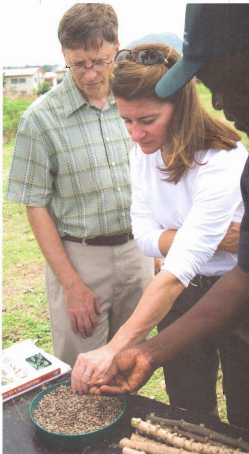
Foundations need strong leadership and vision, such as that provided by co-founders of the Bill & Melinda Gates Foundation. The Gates couple visit one of their projects at a cassava processing plant in Karsana, Nigeria.