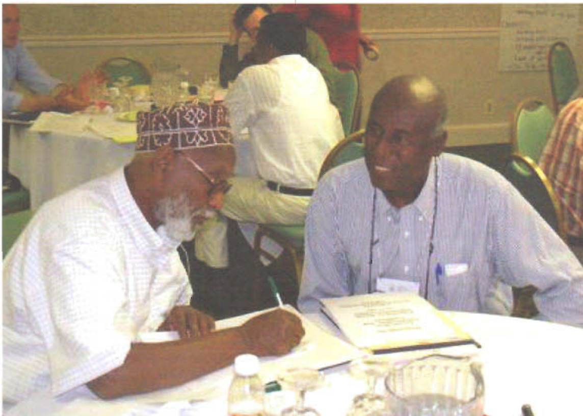
Somali organizers discuss strategy at a training session offered by Mosaica.