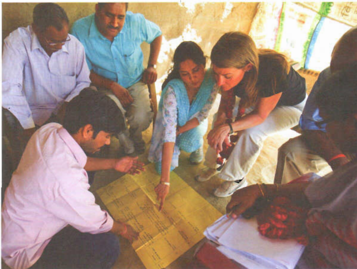
Involving community members in planning ensures an NGO's responsiveness to their needs. Here Melinda Gates, co-founder and co-chair of the Bill & Melinda Gates Foundation, meets with health and sanitation committee members in Kathgara village in Uttar Pradesh, India.

of the newly hired project manager. While it is the executive director's job to address these concerns, she might want to consult with the board to gain